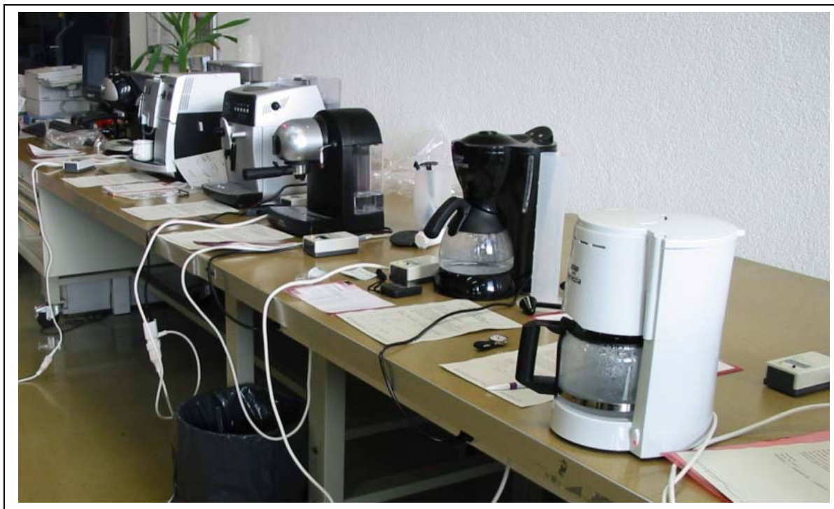
Fig. 1 Measuring campaign S.A.F.E. 2003

Automatic switch-off: programmable delay times should be noted. Identify and note factory setting in programme mode. For measurement purposes, minimum setting should be 2.25 hours.